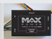
Unrivaled safety features