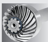
Case hardened spiro-conical gears