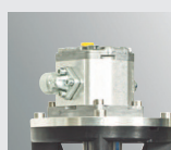
Branded hydraulic components